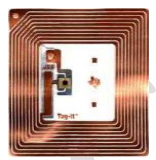
Figure 2: RFID tag

The ATA5570 is a contactless R/W Identification IC for applications in the 125KHZ frequency range. A single coil, connected to chip serves as the IC's power supply and bi-directional communication interface. The antenna and chip together form a transponder or tag.